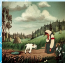
Русская сказка «Сестрица Аленушка и братец Иванушка»

Нарушение запрета: «Не послушался Иванушка и выпил из козьего копытца. Напился и стал козлёночком».