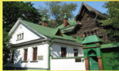
The house-Museum of V. M. Vasnetsov

State Kirov regional art Museum named after V. M. and A. M. Vasnetsov in Kirov. Memorial house-Museum V. M. and A. M. Vasnetsov in Ryabovo village Kirov region.