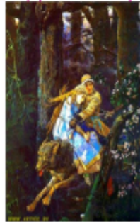
«Иван-царевич на сером волк»