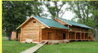
Museum — reserve V. M. Vasnetsov